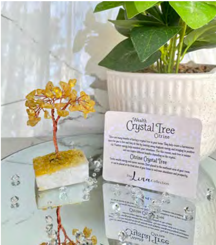
accessories not included